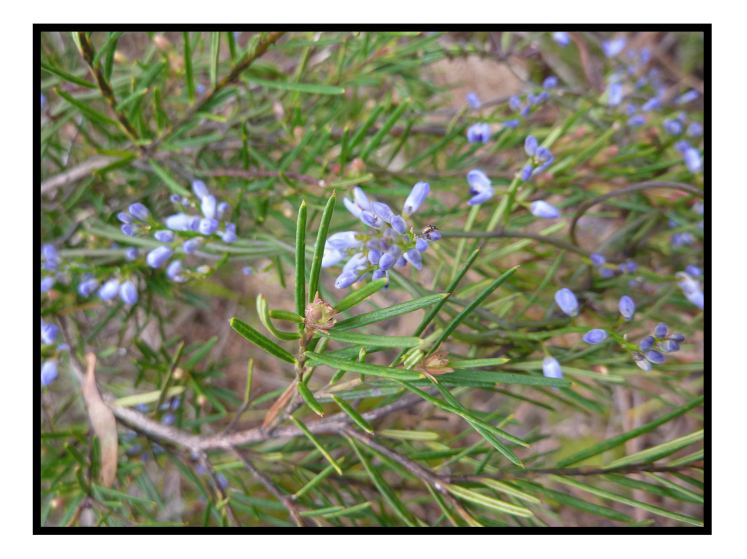
Comesperma volubile, blue lovecreeper

Turning back we made our way along the main track in the reserve noting large prickly box and silver banksia trees, among the flowering coast wattle. Flowering also were riceflowers, lovecreeper and the common heath was seen in white, pale pink and a deeper pink, orchid leaves were seen with none in flower.