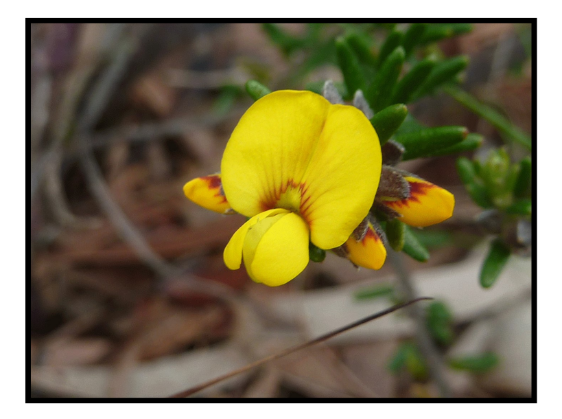
Bossiaea cinerea, showy bossiaea

Birds ~ Artamus cyanopterus, dusky woodswallow; Eolophus roseicapillus, galah; Cacomantis flabelliformis, fan-tailed cuckoo; Chroicocephalus novaehollandiae, silver gull; Coracina novaehollandiae, black-faced cuckooshrike; Corvus tasmanicus, forest raven; Dacelo novaeguineae, laughing kookaburra; Haliaeetus leucogaster, white-bellied sea-eagle; Larus pacificus, pacific gull; Pachycephala olivacea, olive whistler; Pardalotus striatus, striated pardalote; Strepera versicolor, grey currawong; Vanellus miles, masked lapwing with two juveniles